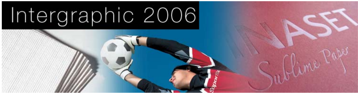
Press release - January 2006